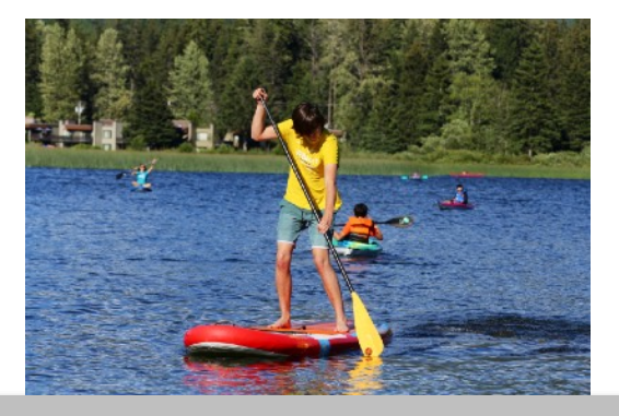
Stand Up Paddle Boarding